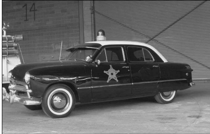
CPHS 1949 Ford as it arrived in January 2008

In December of 2007, the Cleveland Fire Museum acquired an anonymously donated police car. But Curator Paul Nelson had little use for a vintage 1949 Ford Police Car in a fire museum. Thus began the sequence of events that made the Cleveland Police Museum the proud possessor of the vintage model.