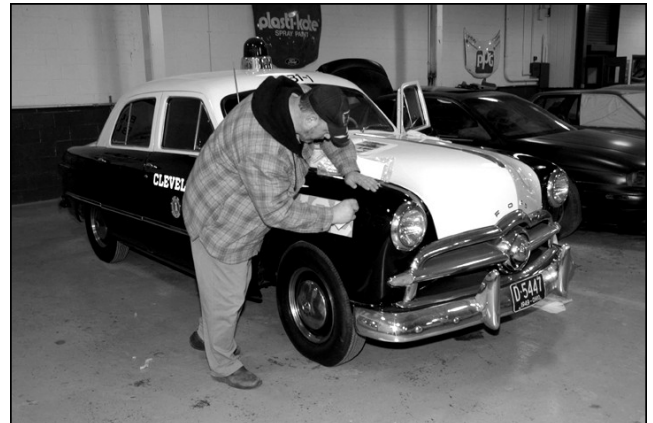
Applying the decals to the Cleveland Police Museum's nearly finished 1949 Ford at the Ohio Technical College.